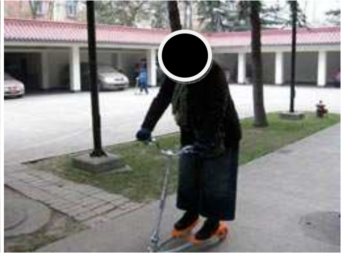
Sichuan version of pork and beans! (It tasted "so-so.") Getting a workout on my friend's new toy.