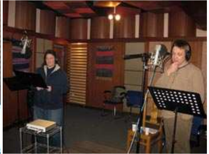
I had a blast recording chants set to music for a new ESL curriculum. My boss and I made quick work of the 70 chants. It was like blitzkrieg! When were all done, the engineer adjusted our voices for each track so we sounded like children. It was a lot of fun! It will make teaching grammar so much easier.