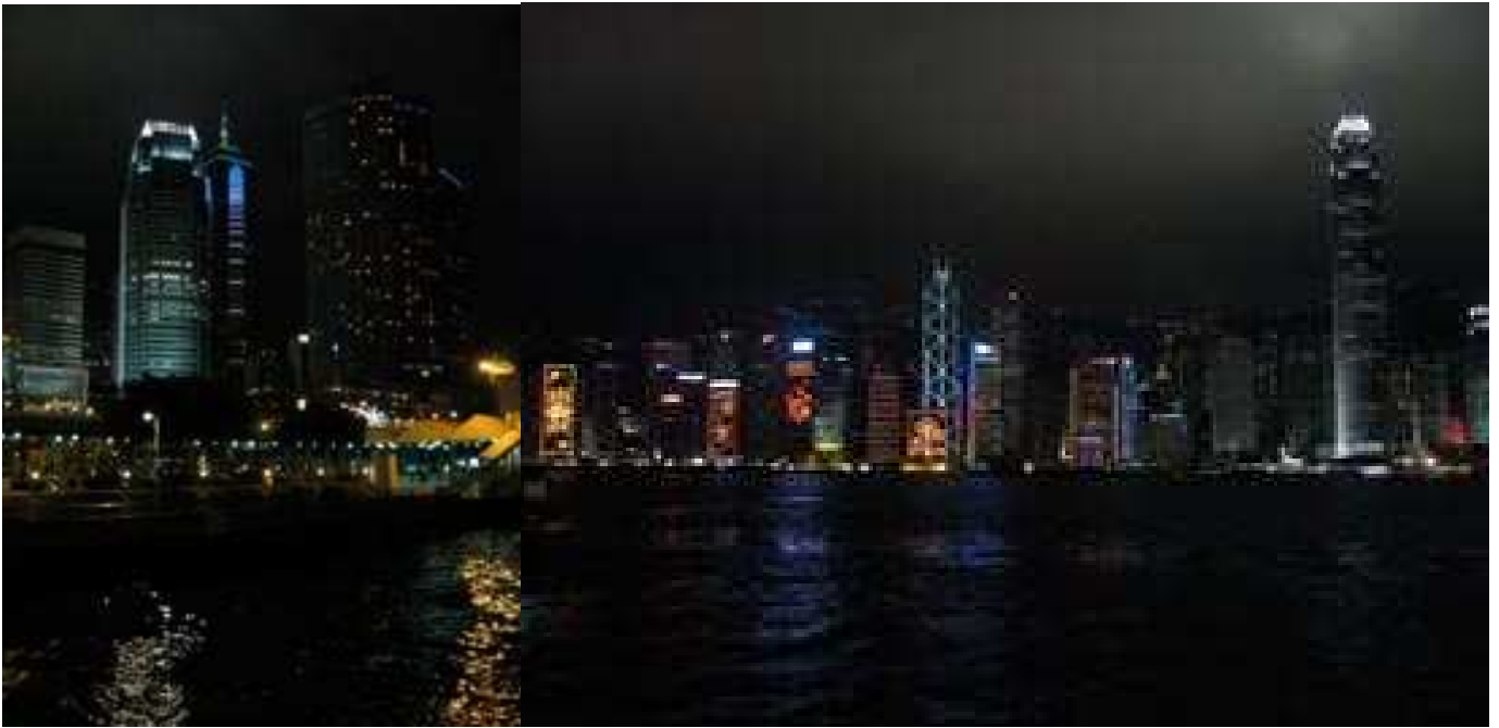
A view of the harbor from the opposite side. Very cool! These pictures were taken on the famous Star Ferry.