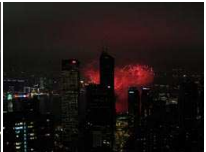
Hong Kong Harbor at night from a condo near the famous "Peak." Left was taken just before fireworks began and Right was taken before the smoke got too thick to see the detail.