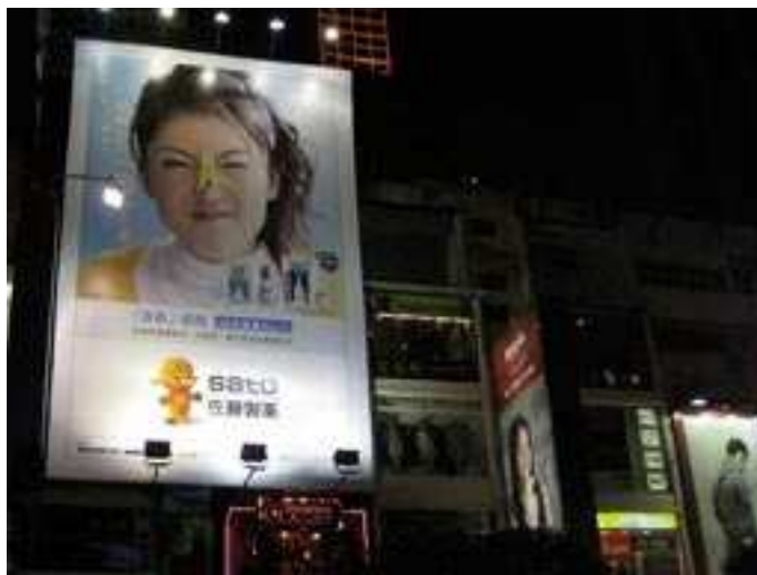
It looks like a dragon, but it's a lion. The lion and accompanying cymbals and drum players paraded through stalls at a famous outdoor market in Hong Kong. Shop owners gave the lion money for good luck in 2009. This billboard cracked me up! Not sure what it's for, but it's funny to me.