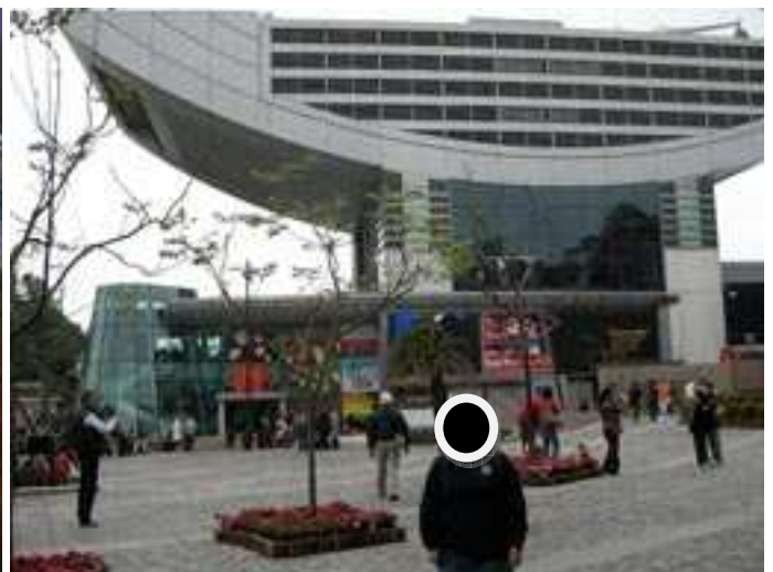
All of Hong Kong's tourist spots Photoshopped into one picture. Behind me is the "Rice Bowl" building.