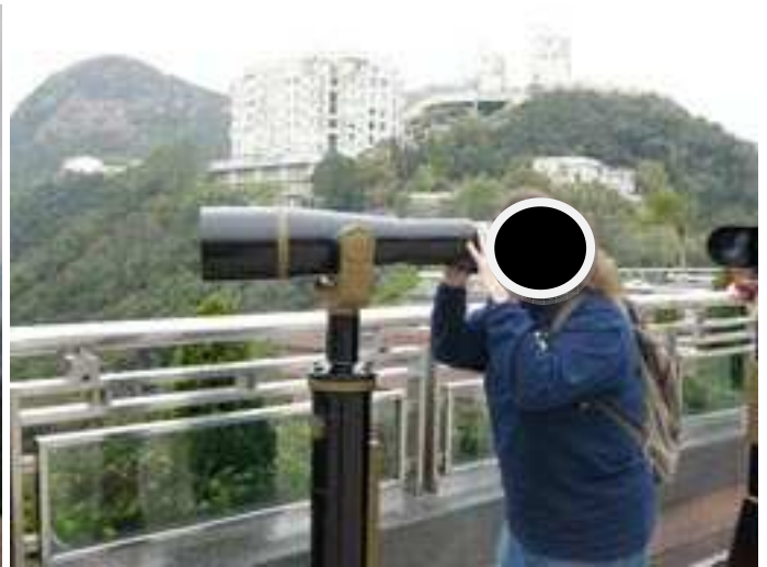
Checking the harbor from the Peak. We rode the trolley straight up (like a Disney ride) and took a bus down.