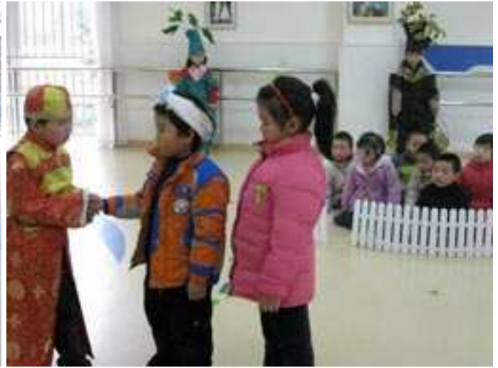
These swans nearly made me swoon with laughter. They were hilarious swishing around in their tutus. The older kids did a sentimental performance about a shepherd who kept losing sheep to wolves – notice the trees in the background as well as the sheep in the white picket fence.