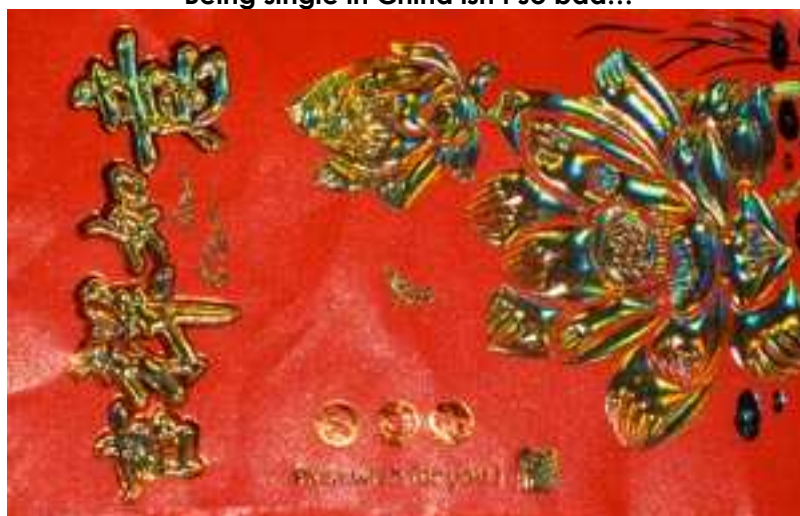
Red envelopes with money are given to single women by their married friends at the time of the annual Spring Festival (Lunar New Year). Not bad, eh?