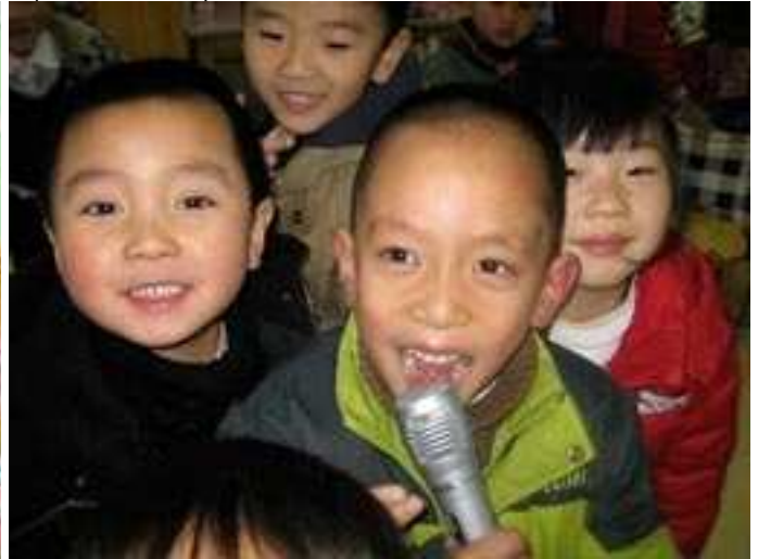
First in Vocab and First in Numbers for the day – very proud. The boys hogging the mic for KTV in class.