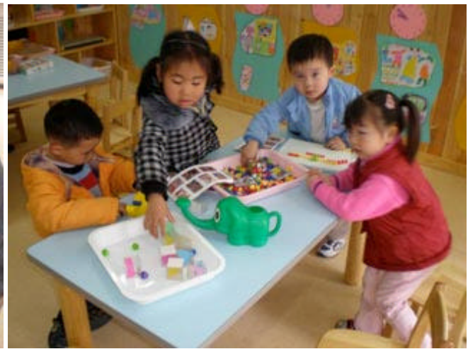
Learning to work together is an important part of their early schooling. In a nation with a "one child policy," helping children learn to work with others can be tricky at times.