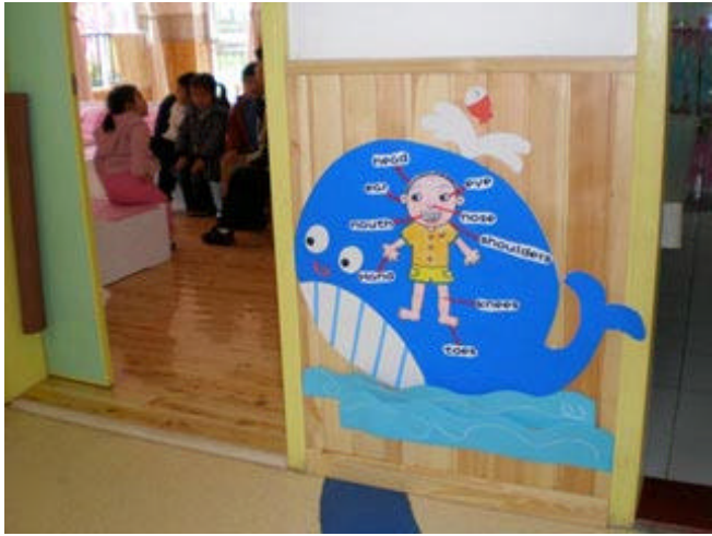
We've moved on to studying face parts as well as general body parts. There's never a dull moment.