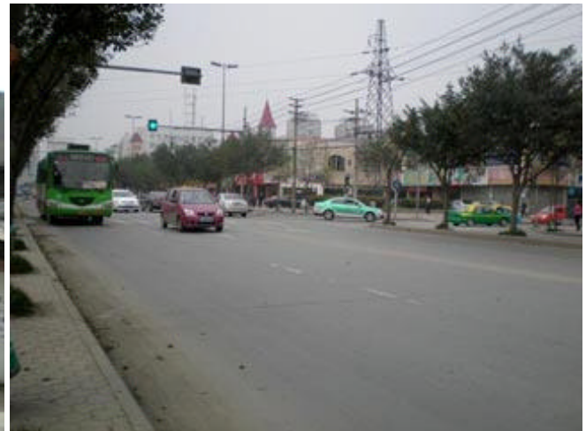
Old sections like this one are slowly being bought out and knocked down, making room for future development. These scenes are familiar to me and make up part of my route to the center of the city. Looking at the picture on the right, notice the street hasn't been swept in a while - we bike riders really appreciate the street sweepers because we “feel” it when they're not around!