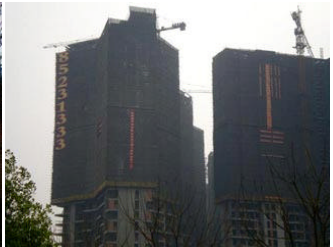
On the left is one of the newest completed projects near my home...just behind it another large block of high rises is underway. To entice people to purchase an unfinished flat, contractors put a contact number on the side of the building as it is being built. Most buildings are sold out before the fifth floor is completed.